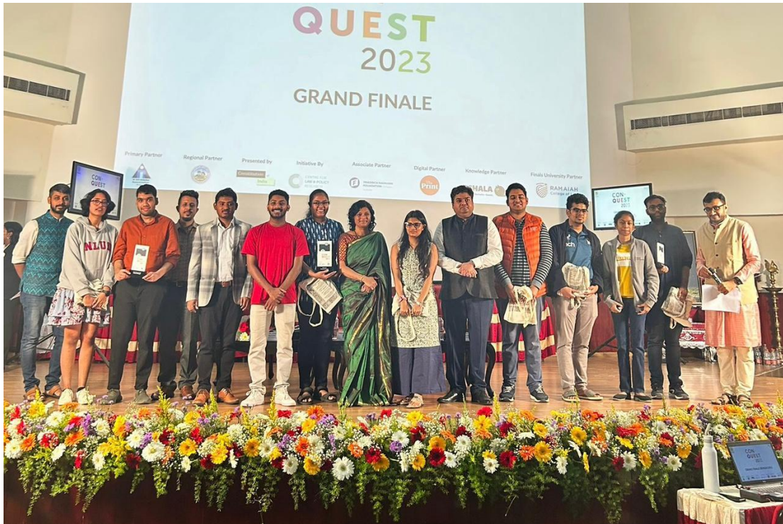
The winning teams of ConQuest 2023